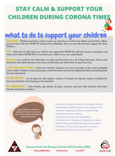
CSR Infographic on "Staying Home and Staying Positive"