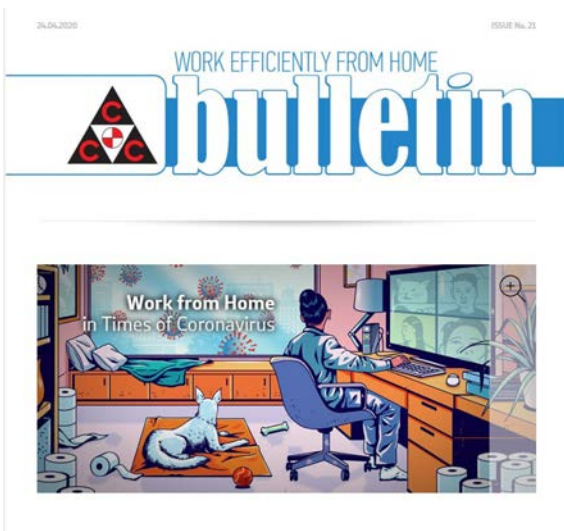
CCC's "Work Efficiently from Home" Bulletin

CCC's "Work Efficiently from Home" Bulletin was developed by IT to share expert knowledge and best practices for working effectively from home as well as sharing advice on resiliency, wellness and staying healthy.