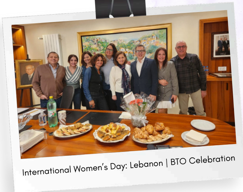
International Women's Day: Lebanon | BTO Celebration