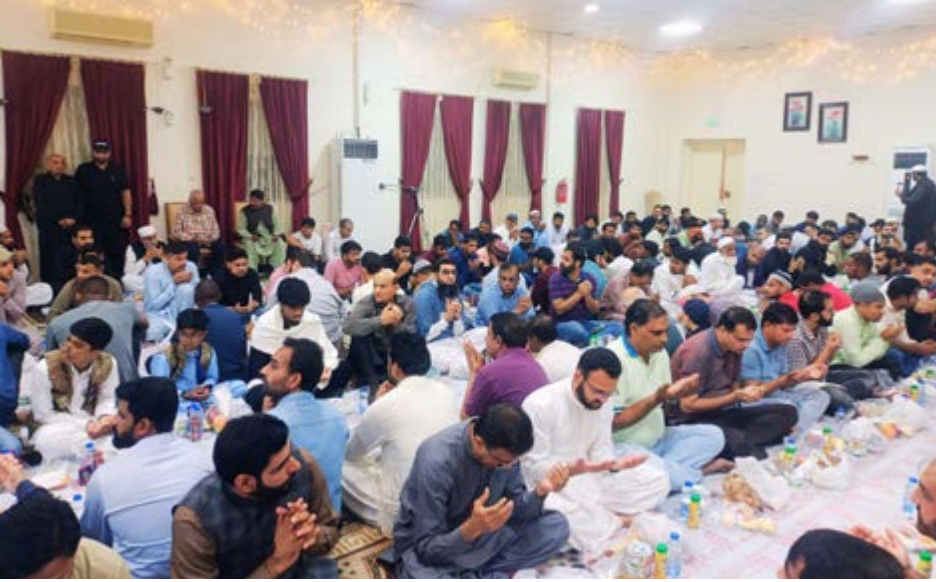
Zero-Waste Iftar Gatherings