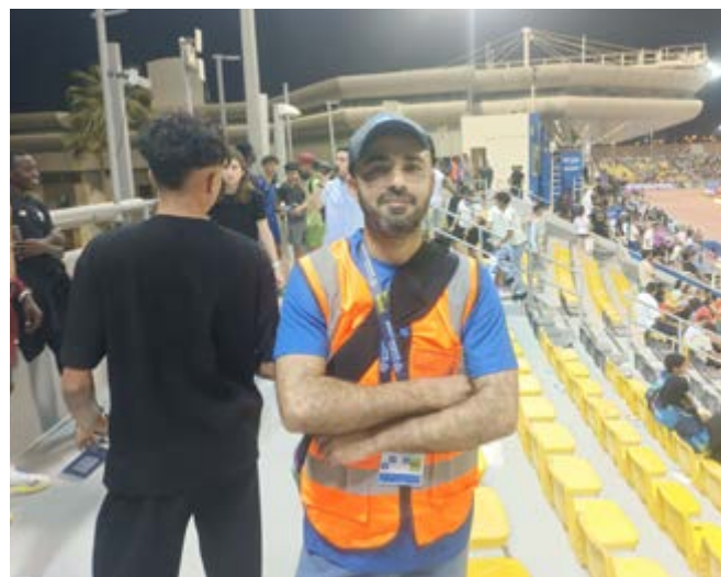
Qatar Olympic Committee's Track & Field Event